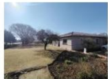
Large garden areas