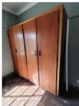
Build in cupboards