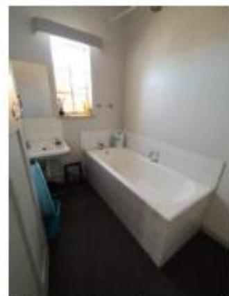
Two bedroom units second