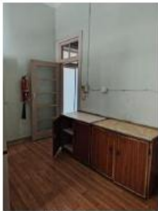
Kitchen cabinets at