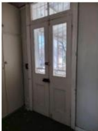
Recreation hall doors onto