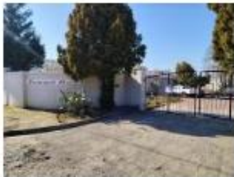
Entrance from street