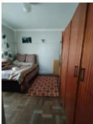
Build in cupboards in