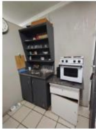
Batchelors kichen units