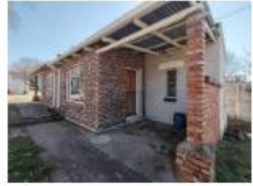
One bedroom units