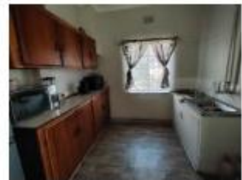
Kitchen of 1 Bedroom unit