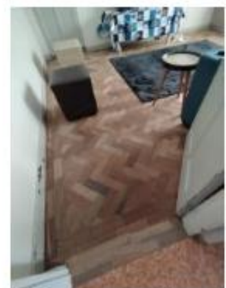
Neat wooden floors