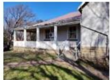
Recreation hall wheelchair