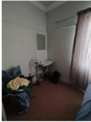
Washbasin in most bedrooms