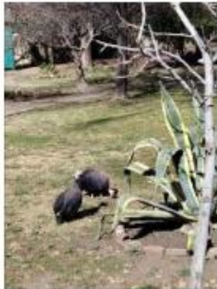
Peaceful tranquil garden