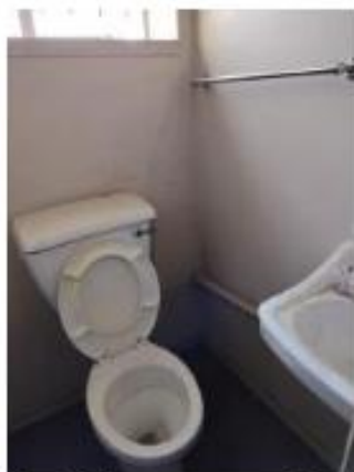
Toilets - male and female