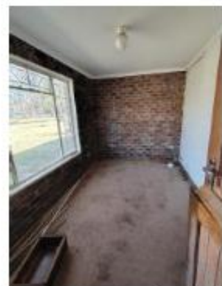
Carpets in 1 Bedroom units