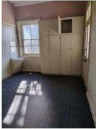
Office at recreation hall