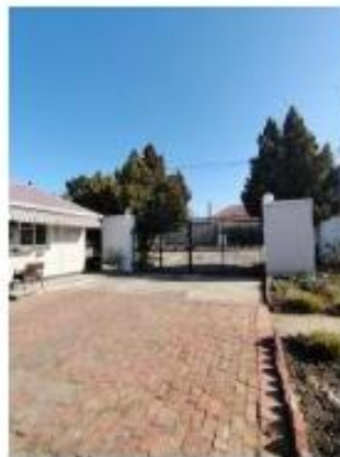
Main gate with Security