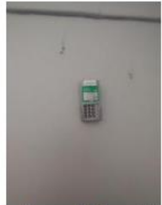
Prepaid in all units