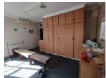
Main office at recreation hall