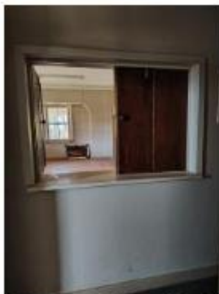
Recreation hall serving hatch