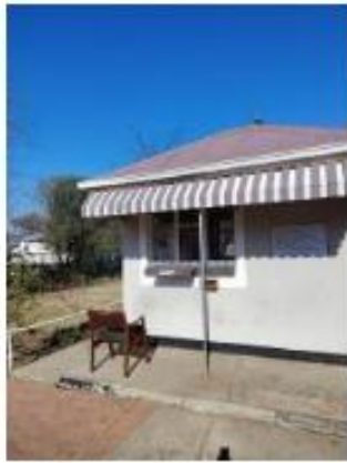
Guardhouse with own toilet