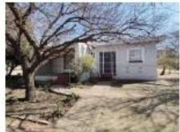
Three bedroom unit