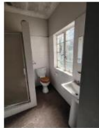
Bathrooms with shower