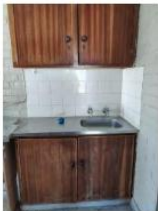
Kitchen of batchelors