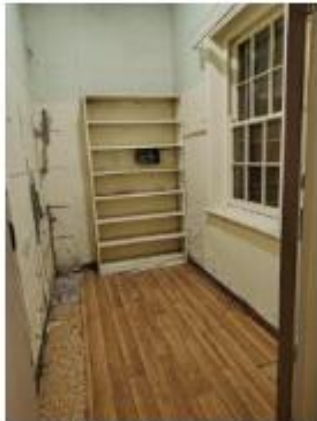
Pantry at Recreational