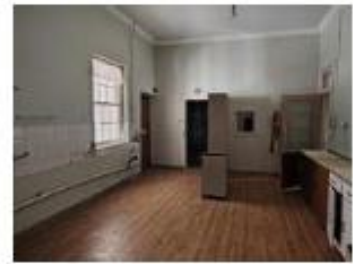
Kitchen at recreation hall