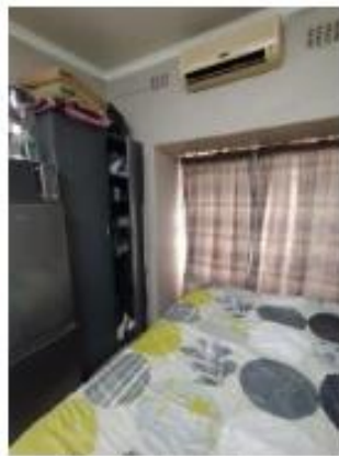
Batcherlor aircons and