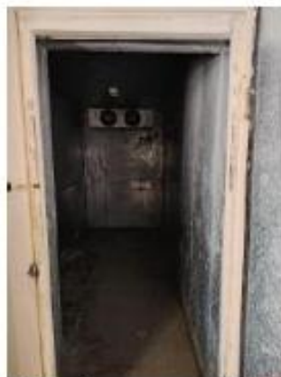
Kitchen walk in fridge at