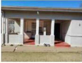
Units next to each other own