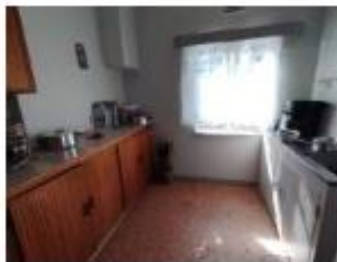
Kitchen in two bedroom units