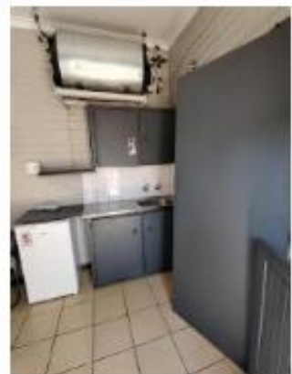
Geysers in all units