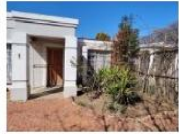
Batchelors sunit with private