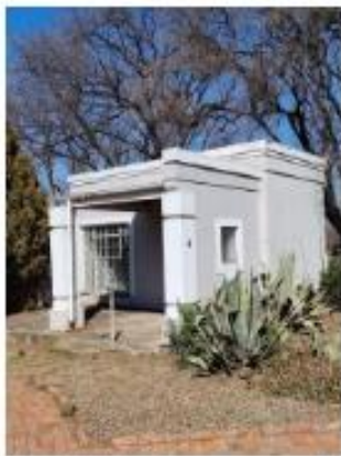
Batchelors unit (2)