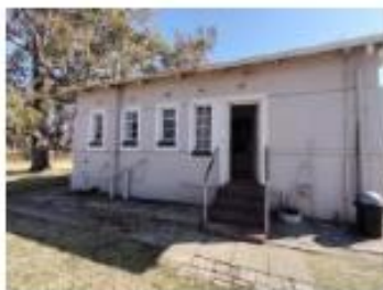
Two bedroom unit back