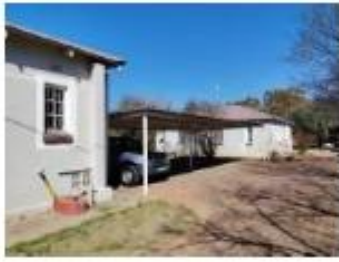
Carports for all units