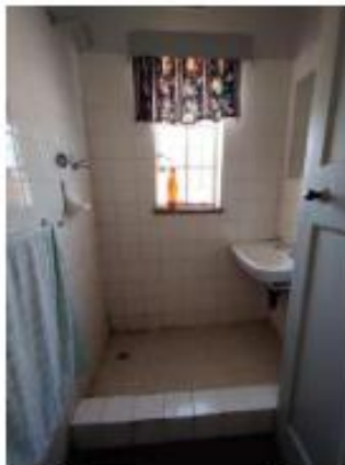
Shower with basin seperate