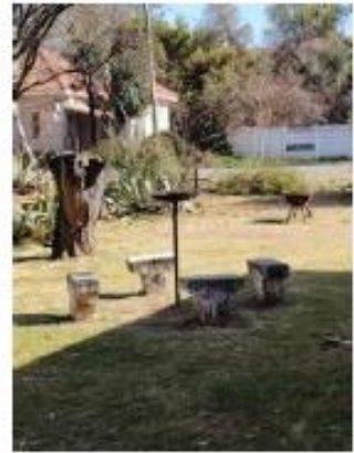
Entertainment areas in garden