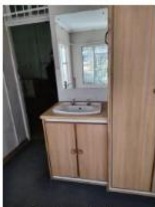
Main office wash basin